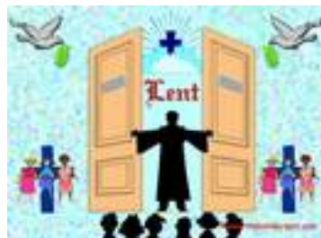
Celebrants Next Weekend

EXCEPTIONS: Women who are pregnant and persons who are sick are not bound by the law of fast.